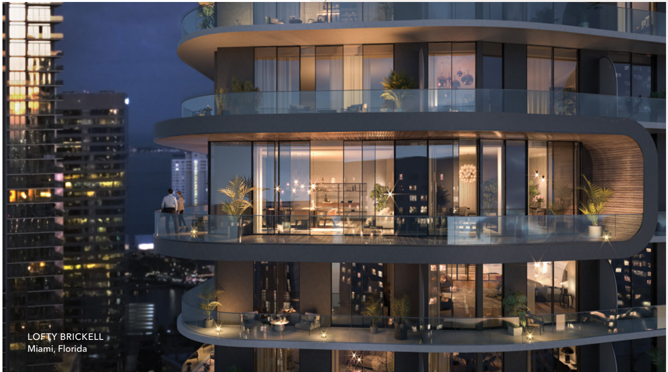
LOFTY BRICKELL Miami, Florida

A SELECTION OF NEWGARD DEVELOPED PROPERTIES