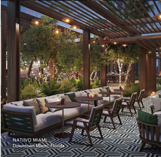
NATIIVO MIAMI Downtown Miami, Florida