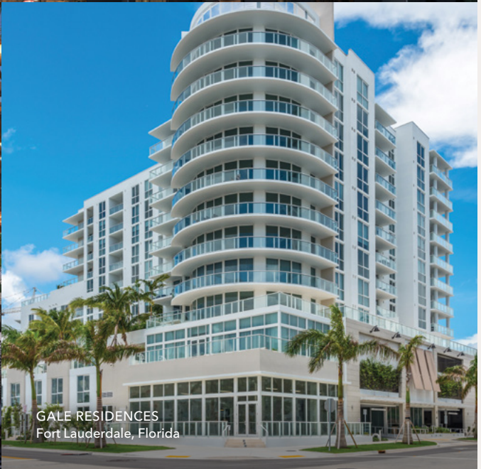
GALE RESIDENCES Fort Lauderdale, Florida